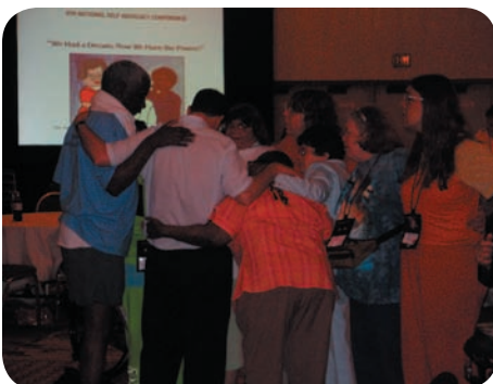
Self-Advocates Celebrating Together at the SABA 2006 Conference in Atlanta, GA. Over 1,500 self-advocates attended.

KENTUCKY: The Kentucky Self-Advocates for Freedom is a statewide organization directed by Kentuckians with disabilities committed to working in partnership to promote equal rights, inclusion, self-advocacy, support and education in all realms of life. KYSAFF is continuing to make progress to encourage self-advocates to speak up for themselves and to teach, coach and support other self-advocates speaking up for themselves. Our members make presentations to groups to share their stories and knowledge about self-advocacy, the electoral process, voting rights, and recent changes in guardianship laws.