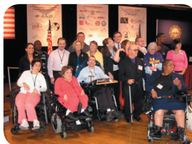
Self-Advocates at the Presidential Candidates Forum in New Hampshire, November, 2007